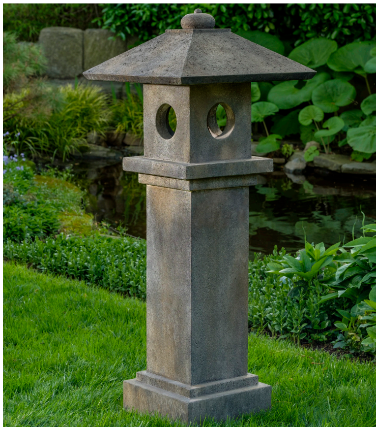
Shown in English Lead

Available in a choice of thirteen (13) exclusive natural pigment stains in addition to natural. All of our patinas are hand applied in a multi-step process which produces unique and beautiful surface finishes. Designed to replicate the look of naturally aged materials, the patinas will not prevent the natural aging process that occurs in an outdoor environment. Rather than creating uniform stains, our approach gives our products their unique beauty and appeal.