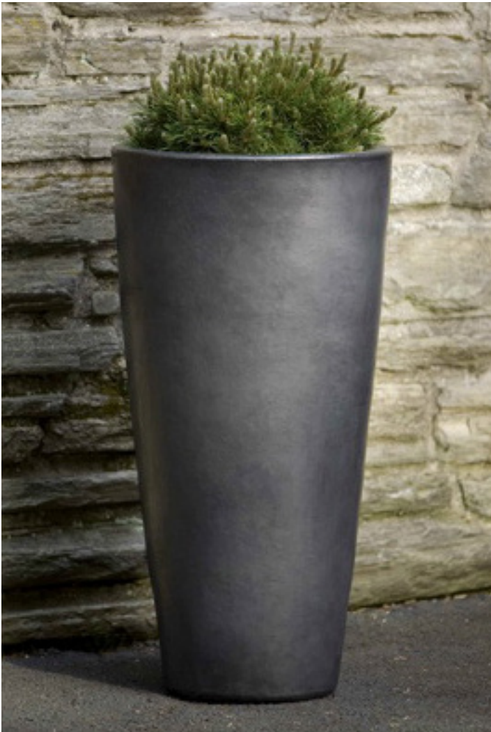
Shown in Graphite