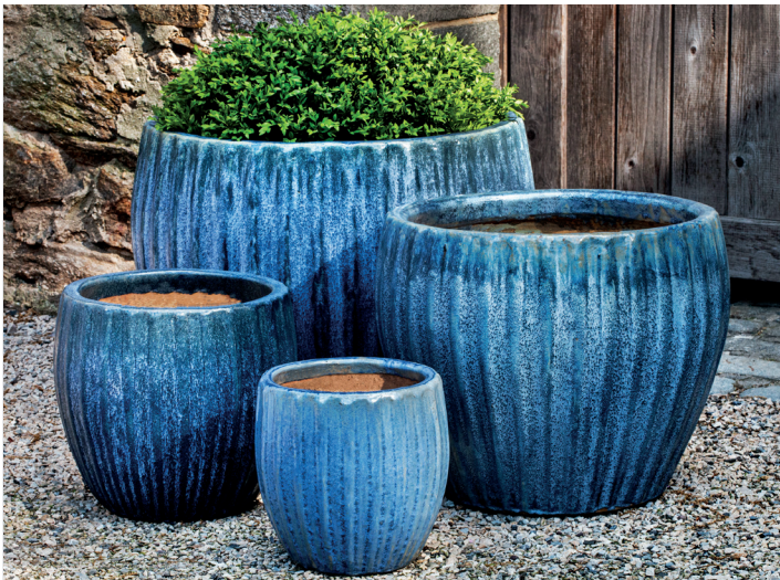
Shown in Blue Pearl