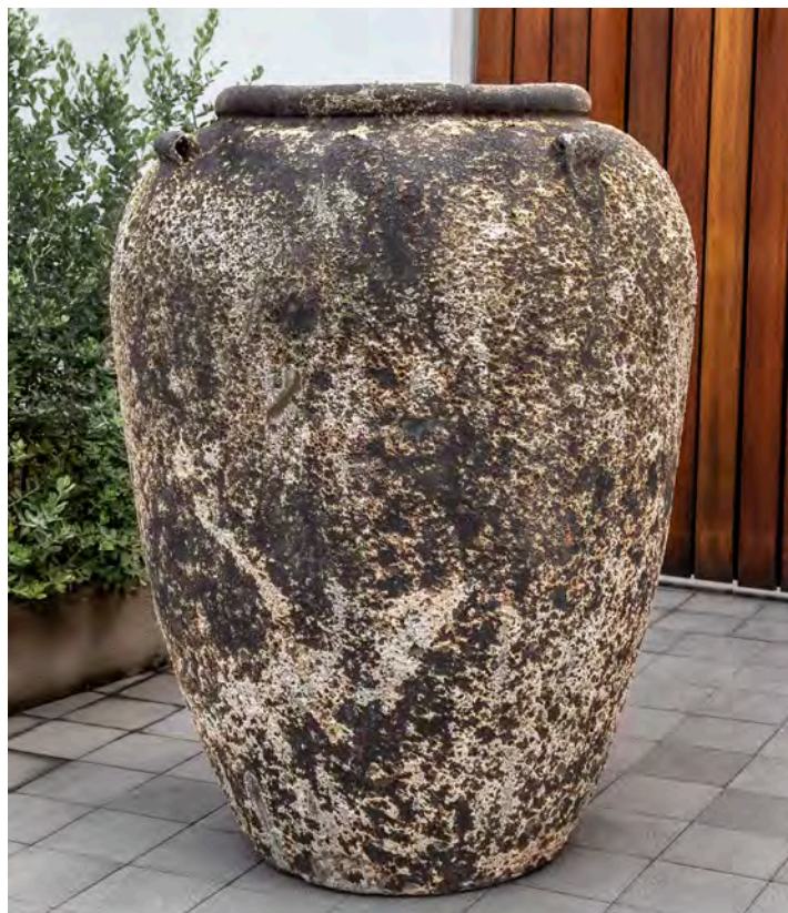
Shown in Aegean