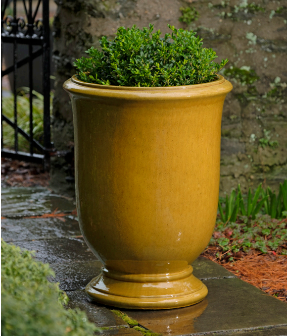
Shown in Honey