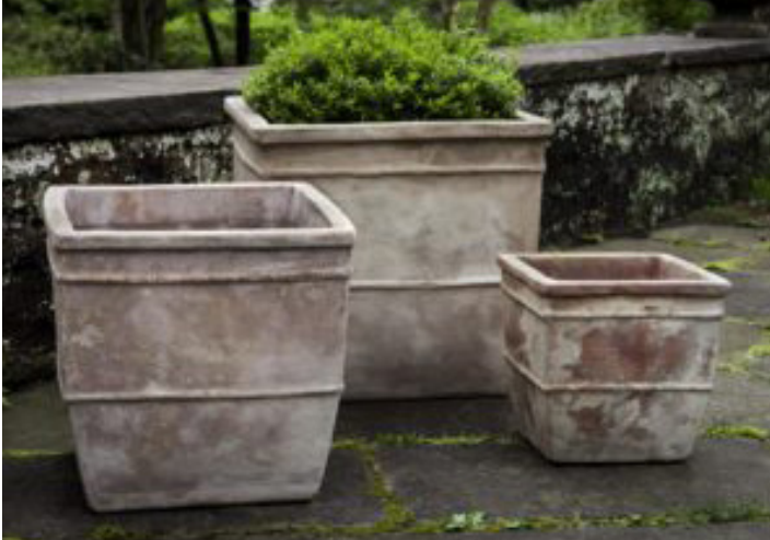
Shown in Antico Terra Cotta