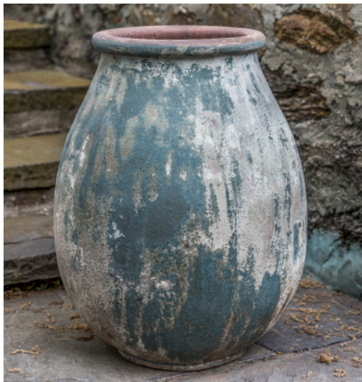
Shown in Vicolo Terra