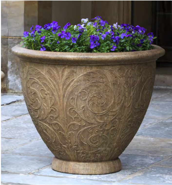
Shown in Aged Limestone