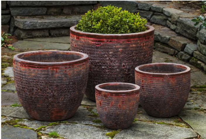
Shown in Angkor Red