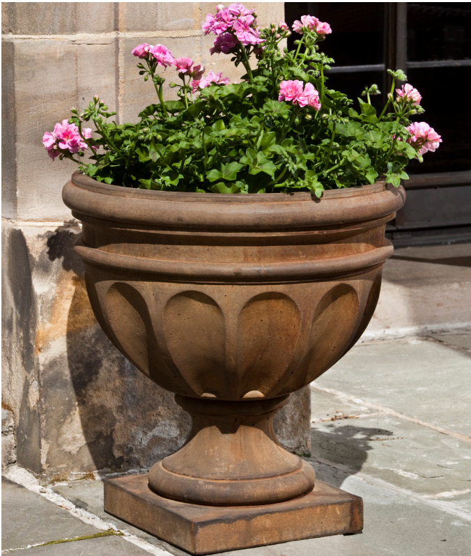
Shown in Pietra Nuova