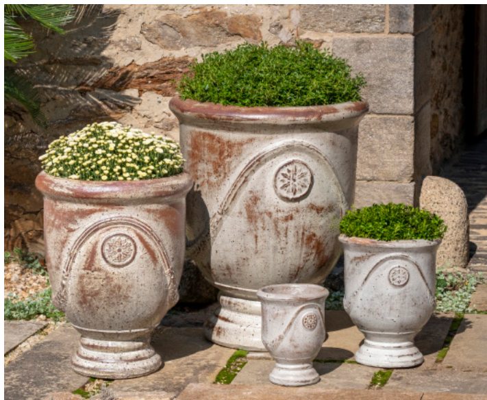
Shown in Crema Antico