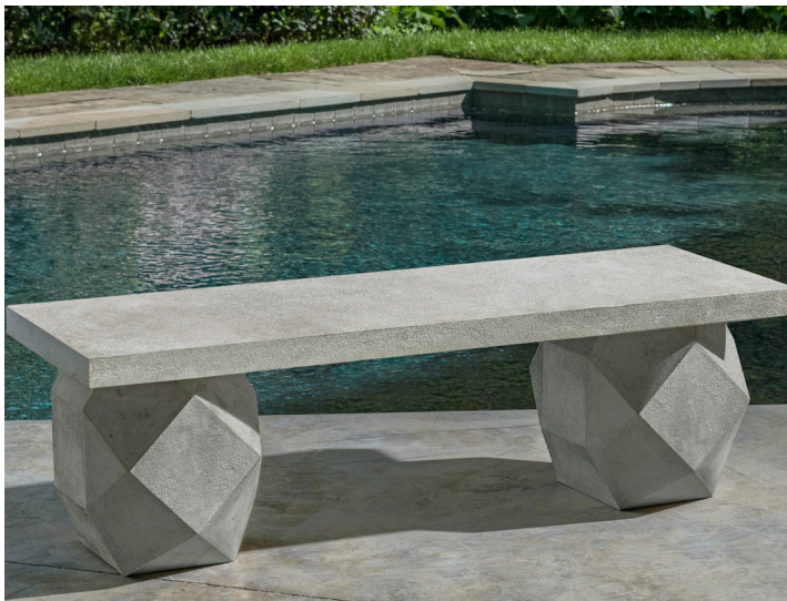
Shown in Greystone