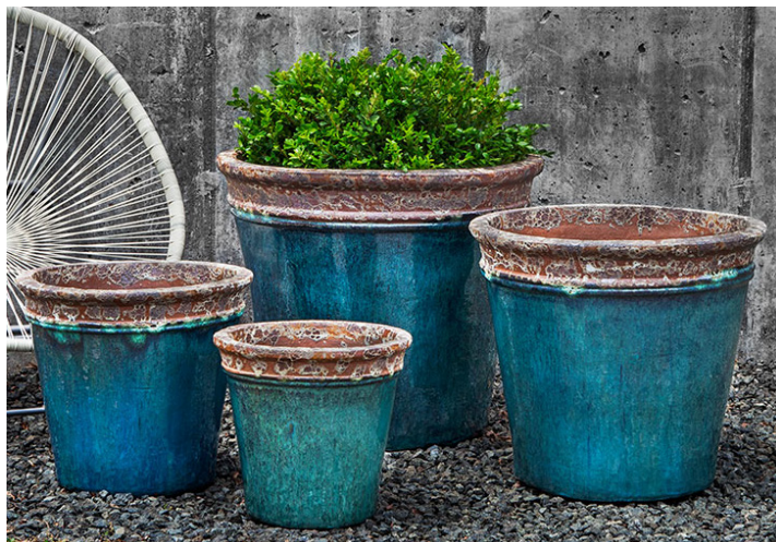
Shown in Beachcomber Aqua