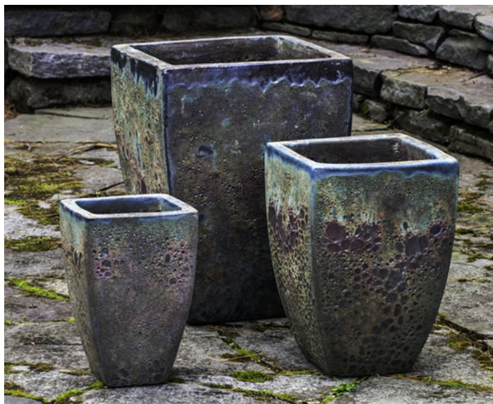
Shown in Angkor Green Mist