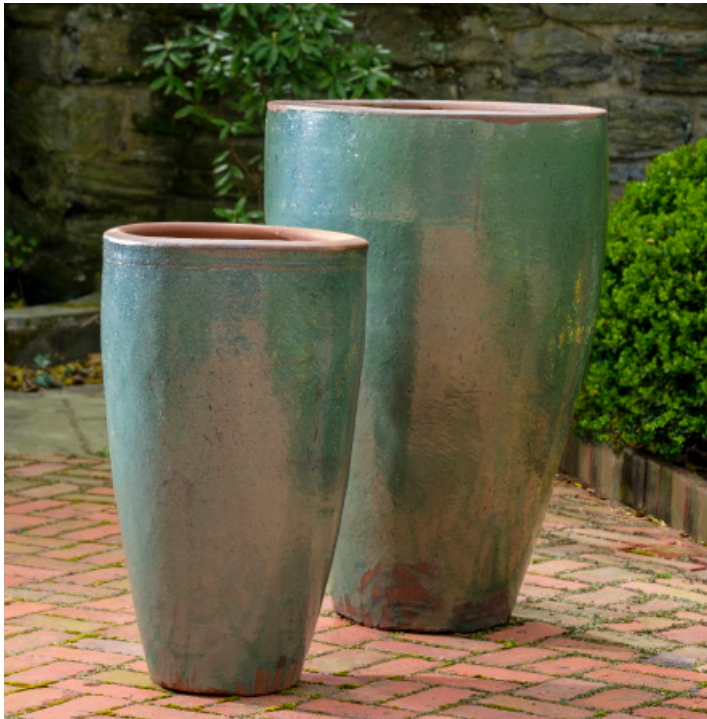
Shown in Rustic Green