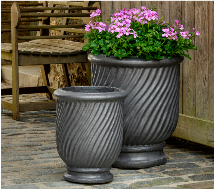
Shown in Graphite