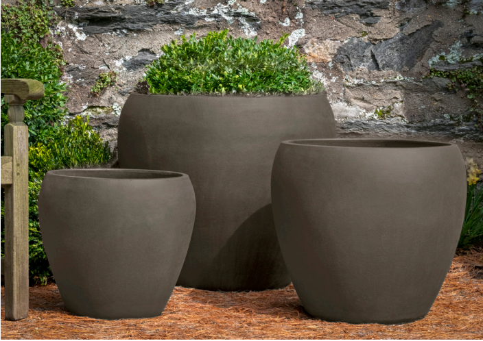
Shown in Peat