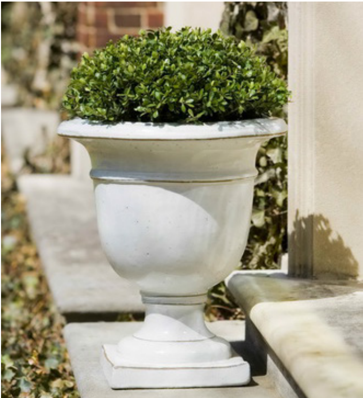
Shown in Antique White