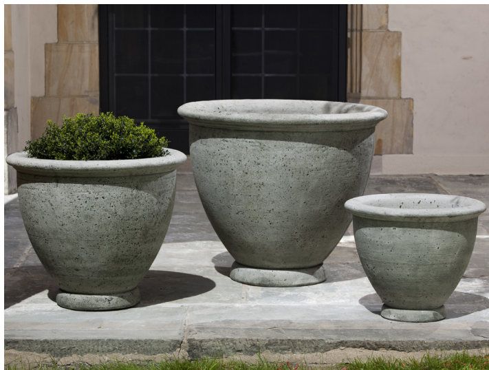
Shown in Alpine Stone

Available in a choice of thirteen (13) exclusive natural pigment stains in addition to natural. All of our patinas are hand applied in a multi-step process which produces unique and beautiful surface finishes. Designed to replicate the look of naturally aged materials, the patinas will not prevent the natural aging process that occurs in an outdoor environment. Rather than creating uniform stains, our approach gives our products their unique beauty and appeal.