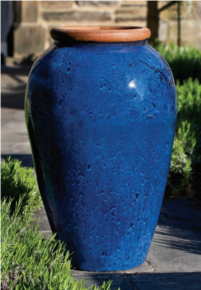
Shown in Rustic Blue