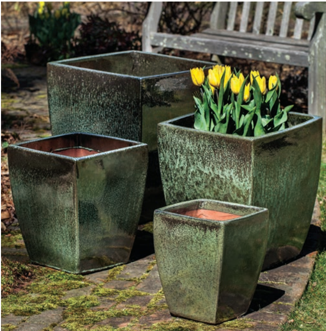
Shown in Green Metallic