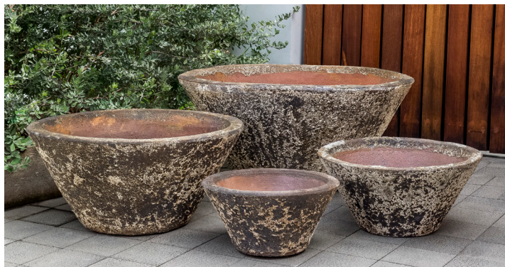
Shown in Aegean