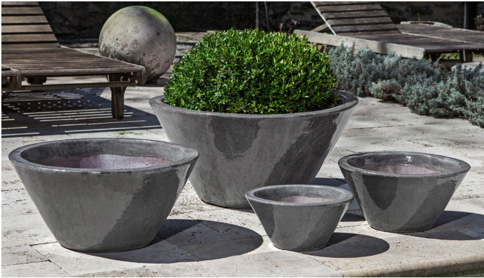
Shown in Snow Monkey