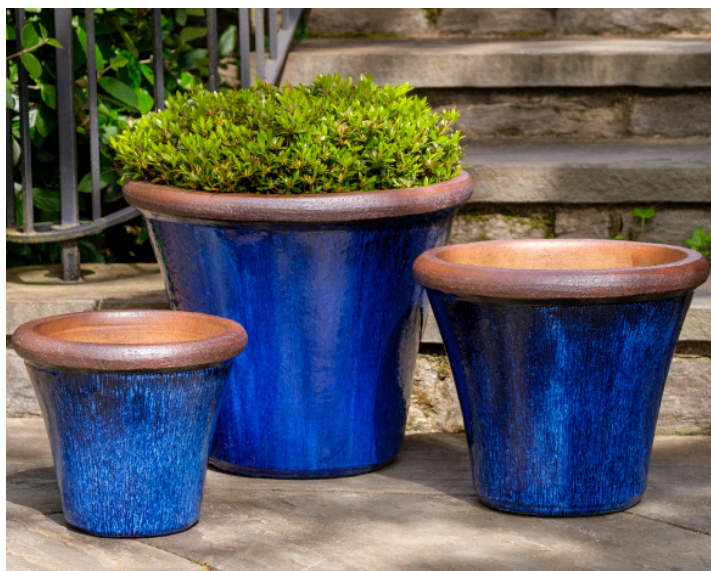
Shown in Riviera Blue