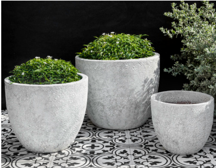
Shown in White Coral