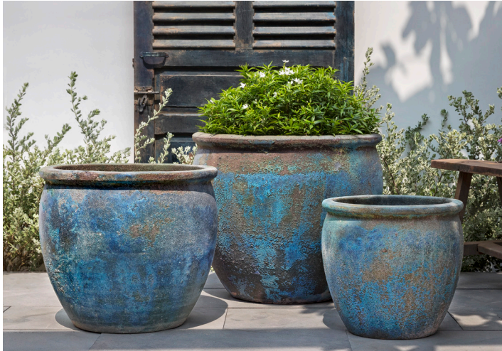
Shown in Blue Verdigris