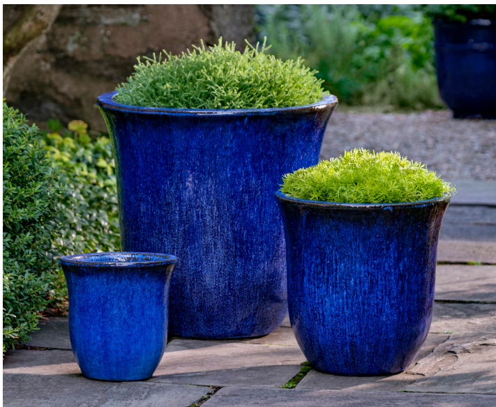
Shown in Riviera Blue