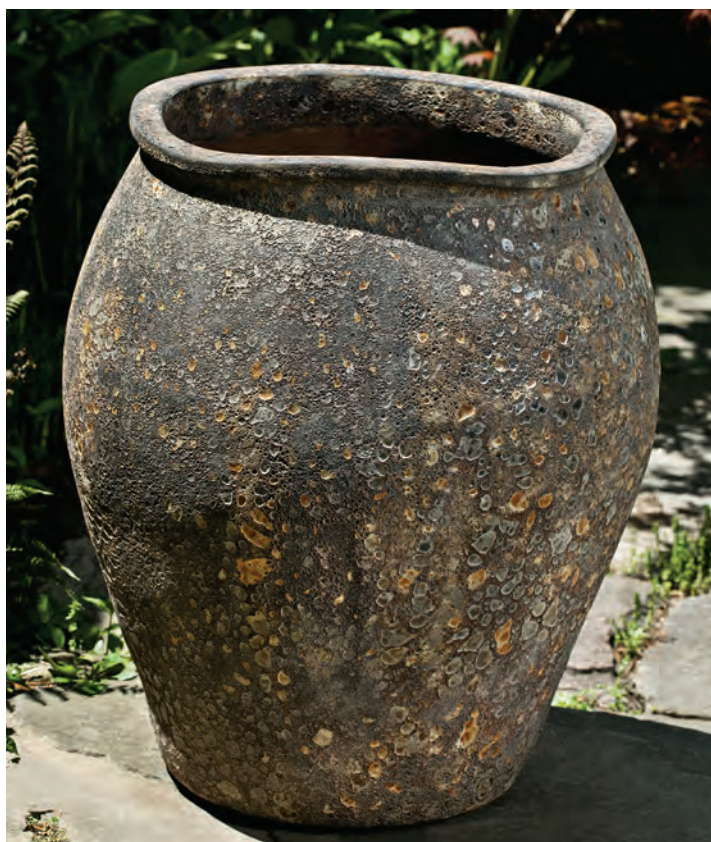
Shown in Angkor