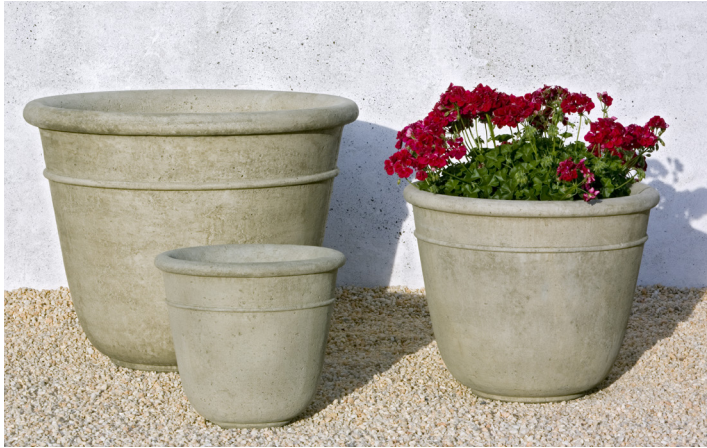
Shown in Verde