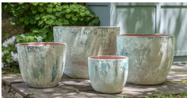
Shown in Vicolo Terra