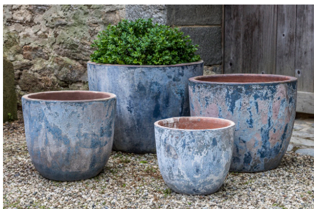
Shown in Vicolo Mare