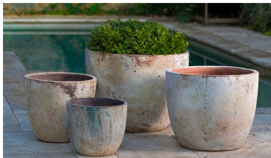
Shown in Vicolo Sabbia

Please note that actual colors may vary slightly from those depicted here.