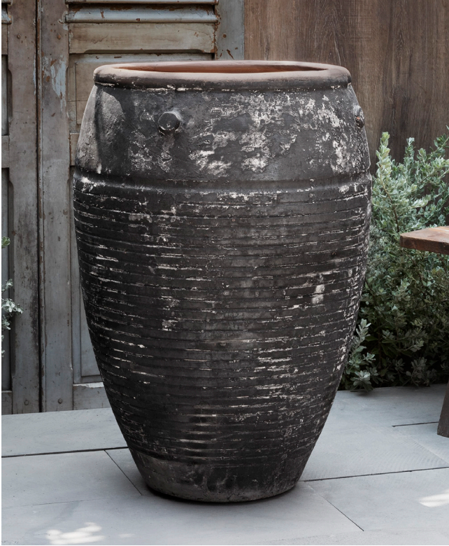
Shown in Vicolo Noir