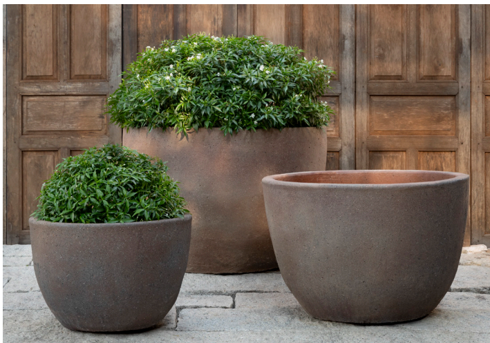
Shown in Sandblasted