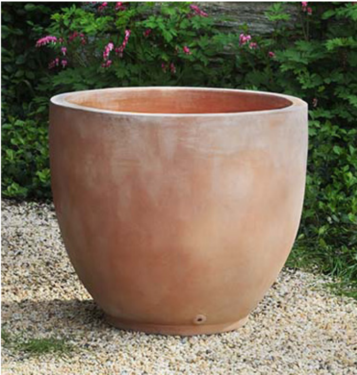
Shown in Terra Cotta