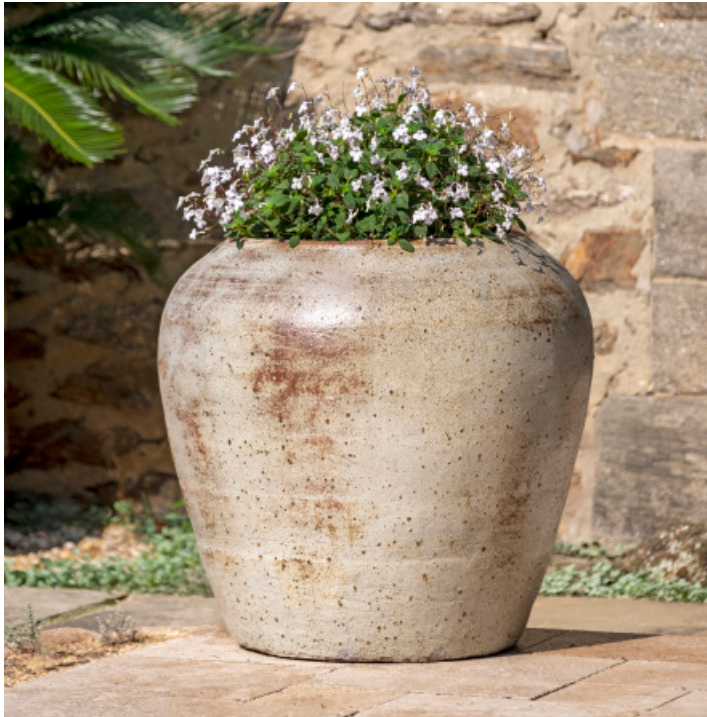
Shown in Crema Antico