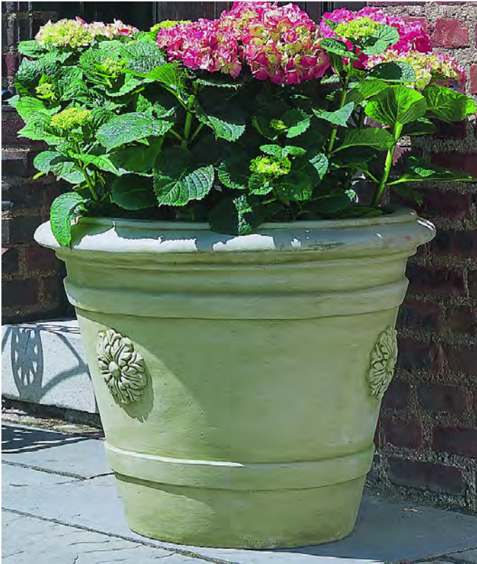
Shown in English Moss

Available in a choice of thirteen (13) exclusive natural pigment stains in addition to natural. All of our patinas are hand applied in a multi-step process which produces unique and beautiful surface finishes. Designed to replicate the look of naturally aged materials, the patinas will not prevent the natural aging process that occurs in an outdoor environment. Rather than creating uniform stains, our approach gives our products their unique beauty and appeal.