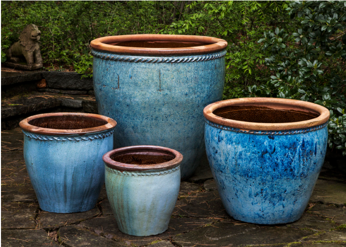
Shown in Rustic Blue