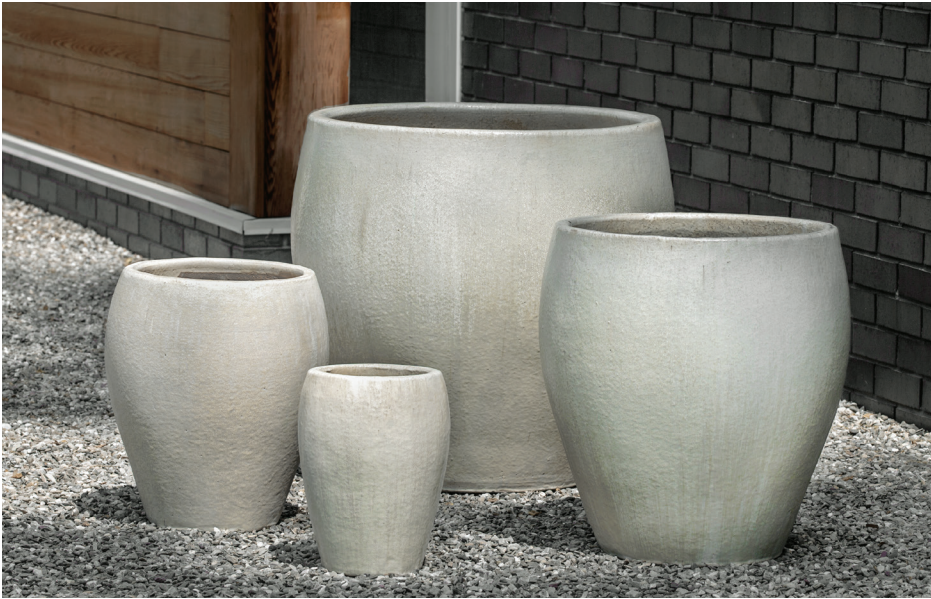
Shown in Antique Pearl