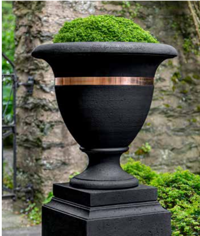
Shown in Nero Nuovo