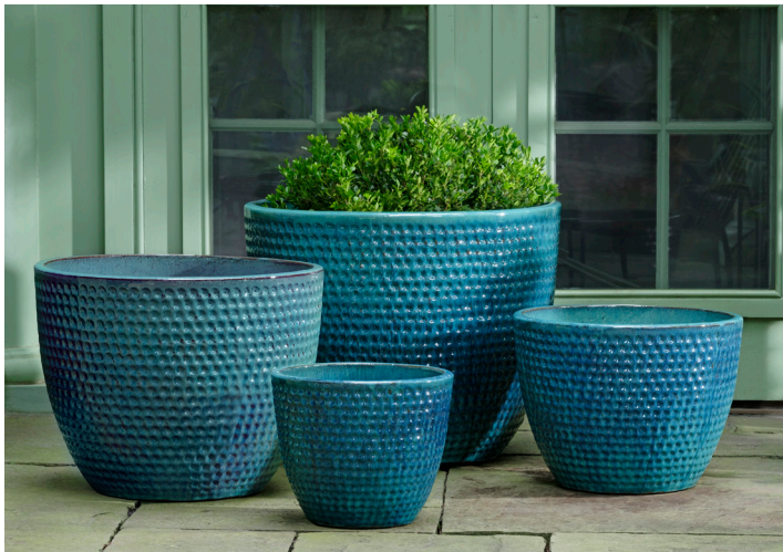
Shown in Aqua