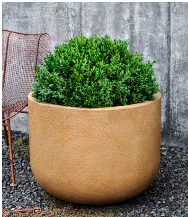
Shown in Travertine