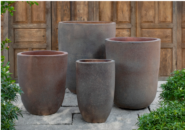
Shown in Sandblasted