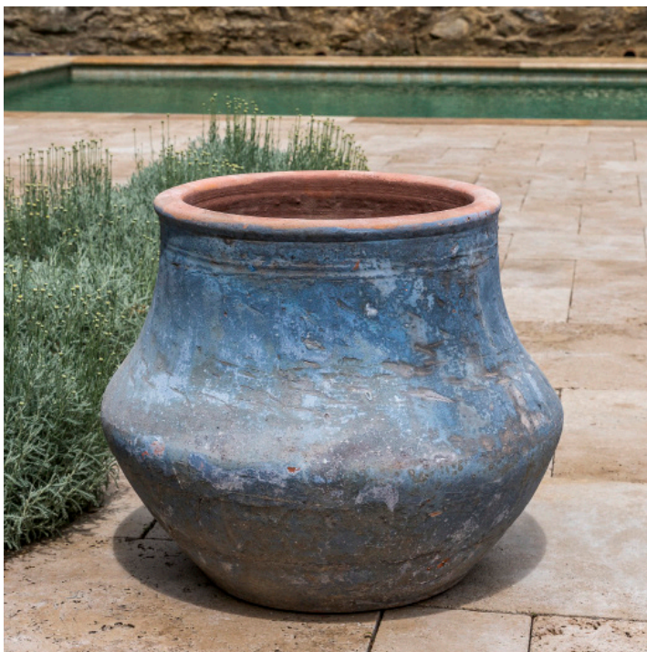
Shown in Vicolo Mare