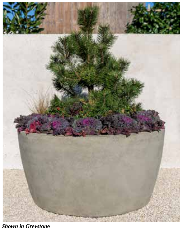
Shown in Greystone