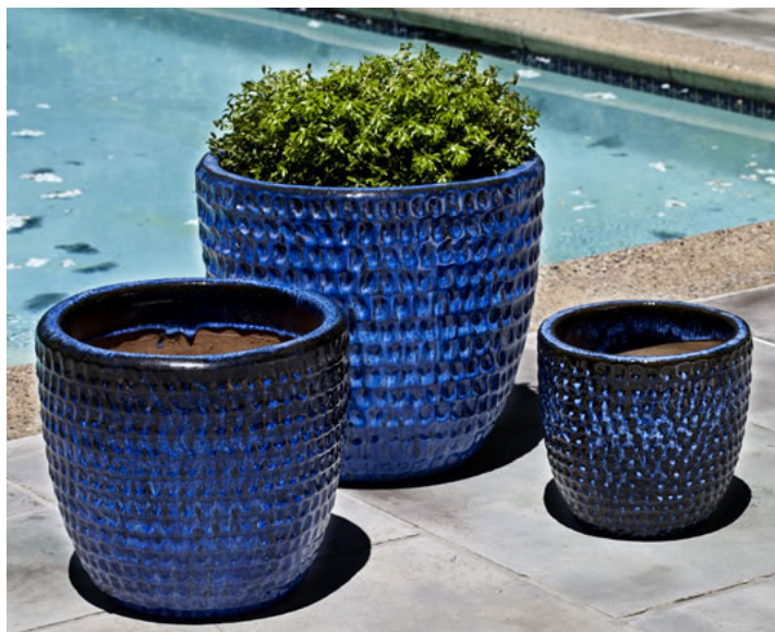
Shown in Riviera Blue