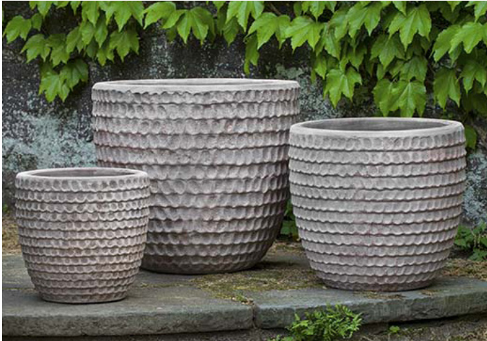
Shown in Antico Terra Cotta