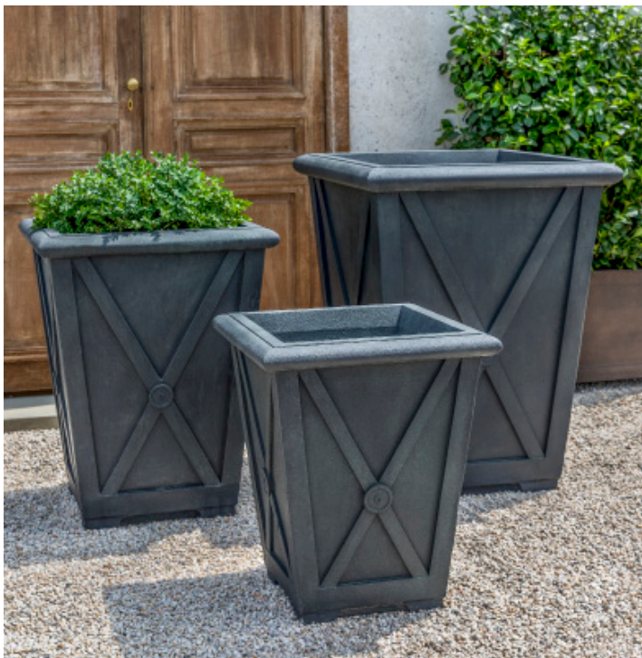
Shown in Lead Antique