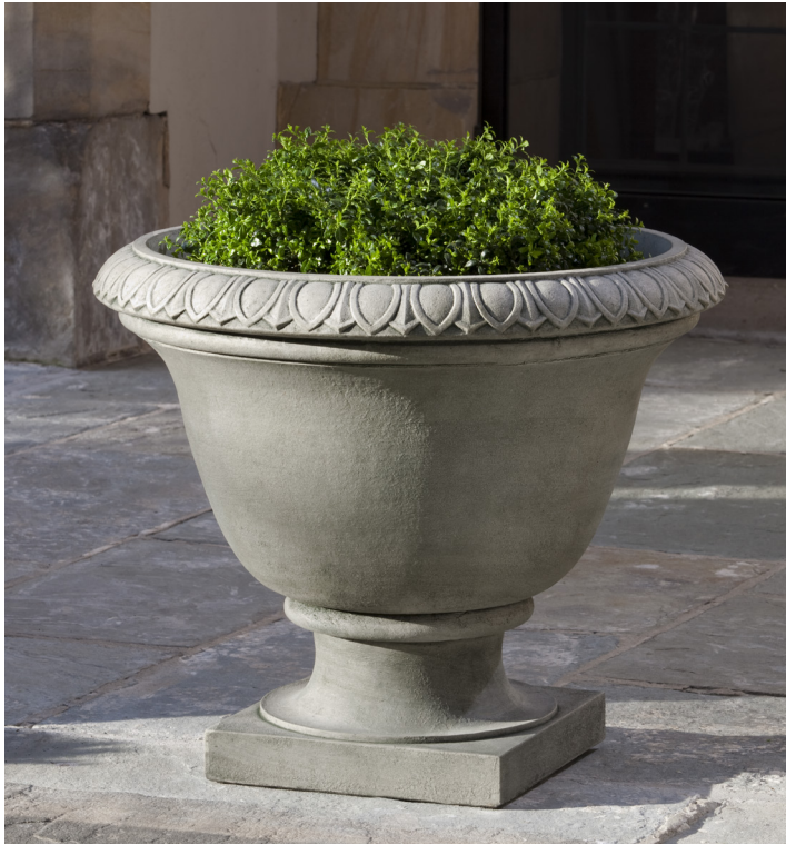
Shown in Greystone