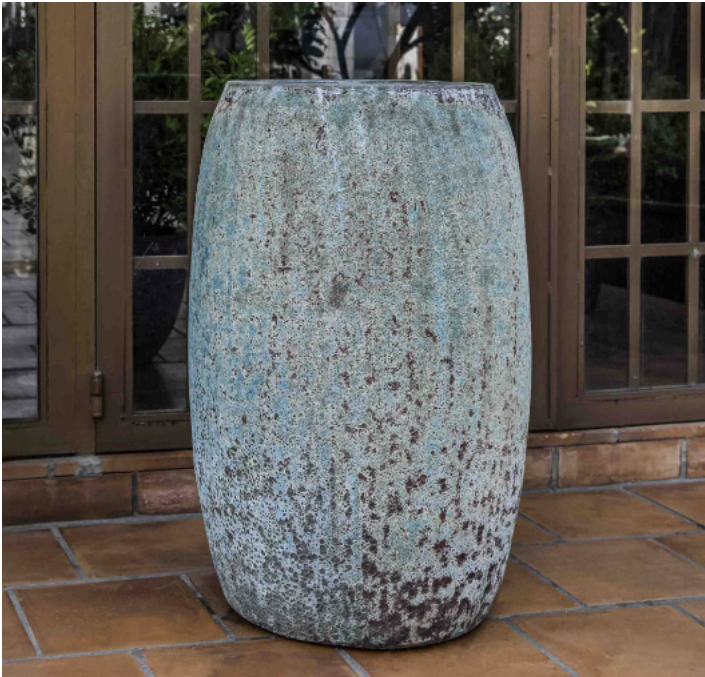
Shown in Verdigris