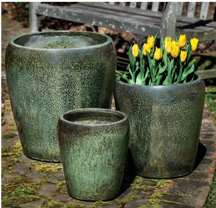
Shown in Green Metallic