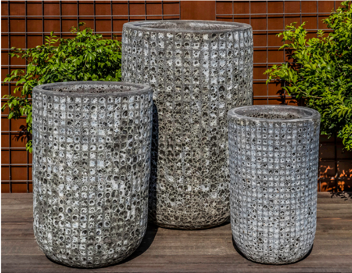
Shown in Fossil Grey